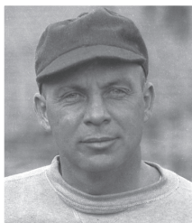
Dana X. Bible 1935-1936